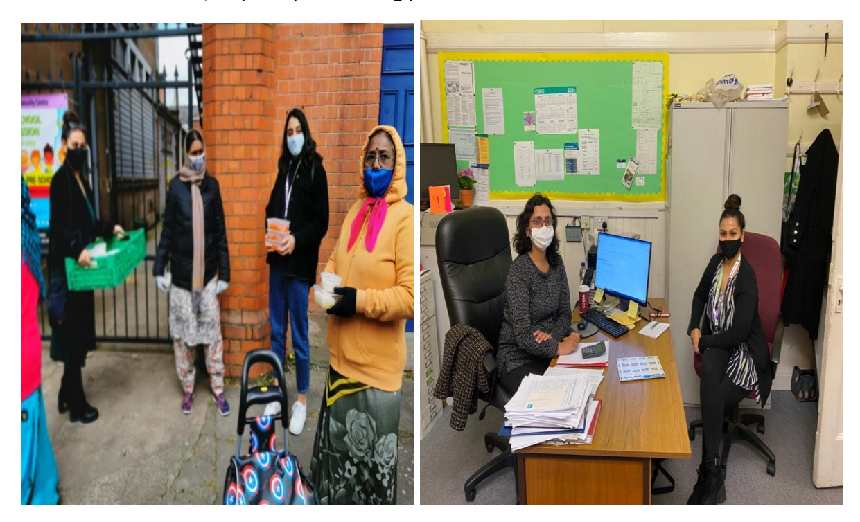
"I cannot thank the Community Deveopment Team for supporting Wesley Hall and the community. The impact it will have to support so many on the poverty line is greatly appreciated".

Delivering hot food to Wesley Hall food bank in Highfields/spinney hill area. 270 people queue three times a week for food here and it is a honour for the community development team to work in partnership to support this much needed community. We have also funded for the community to have weekly session via zoom on Fitness, Yoga, Mehndi, Hapiness and Mindfulness with 30/40 participants taking part each week.