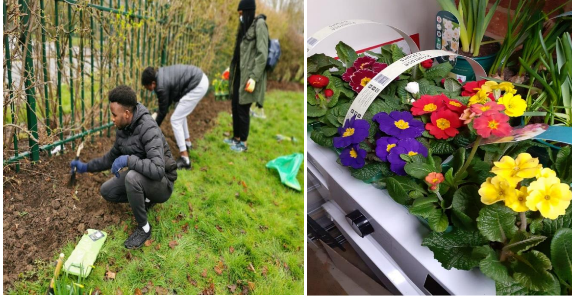
"it was a great day out and it felt so good to help and support another community"